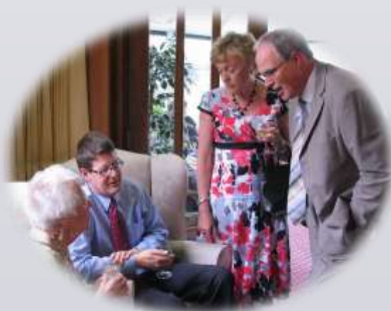
100 Years Birthday Celebration at Hewlett Court