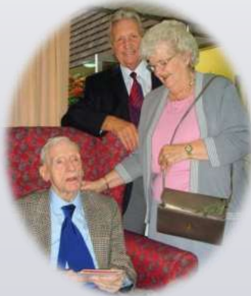
Another 100 Year Celebration at Hewlett Court