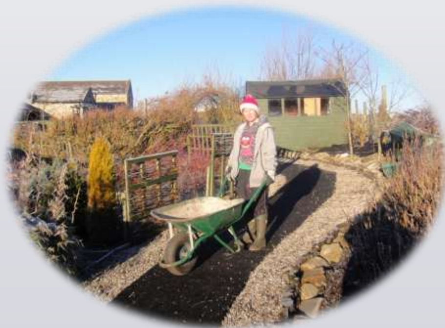
Masonic Families active in the Community The Coldwell Inn Project

In 2010, grants totalling £31,181 were made to 21 organisations or good causes. To date, no grants have been refused on the grounds of lack of funds. Full details of grants made can be seen on the Charity website, www.elmc.co.uk and are also printed on page 46.