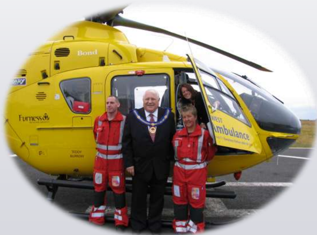
Grand Charity gave £12,000 for the North-West Air Ambulance Service