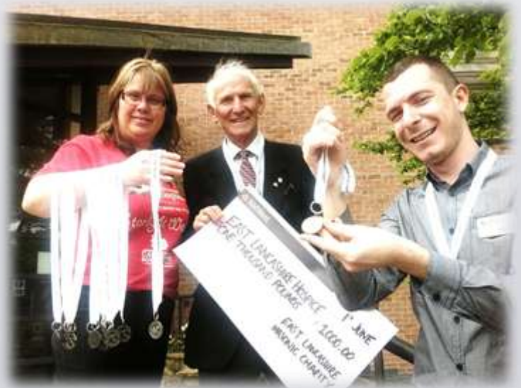
Donation to East Lancs. Hospice