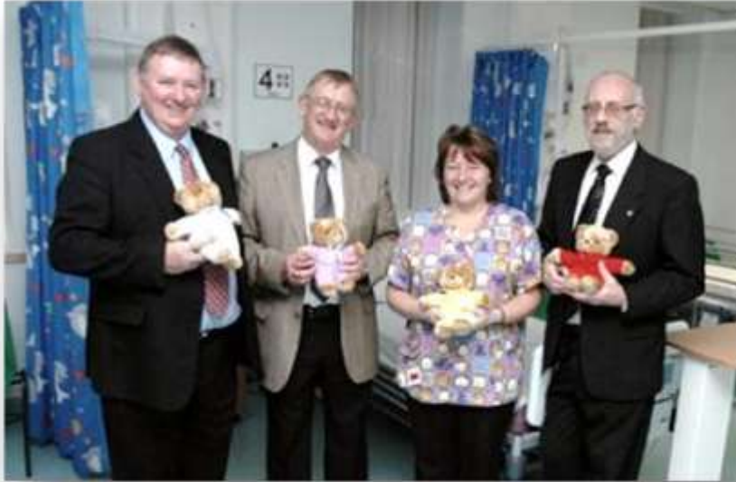
Teddies for Loving Care Presentation at Crumpsall Hospital

The Charity is the central vehicle for the delivery of Masonic charity and care on behalf of Freemasons in East Lancashire. It augments the charitable work of Freemasons in their Lodges and Districts by supporting those in need within the wider Masonic “family”, eligible projects which benefit local communities and other good causes.