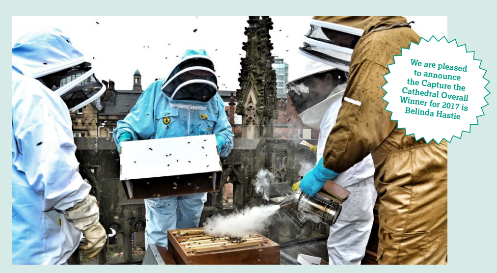
Something Different – Holy Smoke by Belinda Hastie