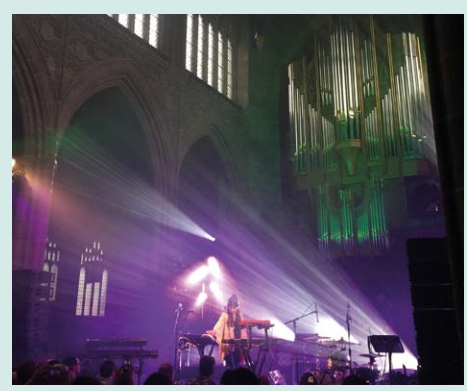
Cathedral at Night – Let there be Light and Lasers by Becky Ryding

Entrants were invited to take photographs in three categories: Architecture and Stained Glass, Cathedral at Night and Something Different. The judges chose a winner in each category and an overall winner. The winners are as follows: