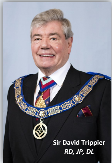
Sir David Trippier RD, JP, DL