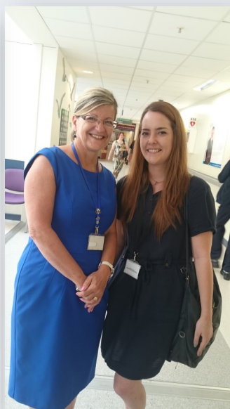
Some of the dozens of recipients of our charitable donations