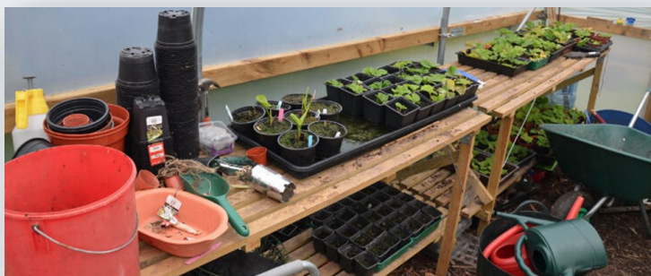
£3000 to Growing Wild to fund a Poly Tunnel