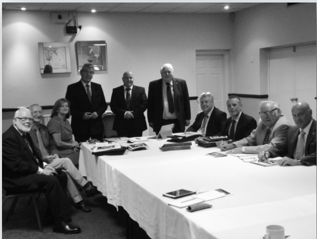
ELMC Board of Directors 2016