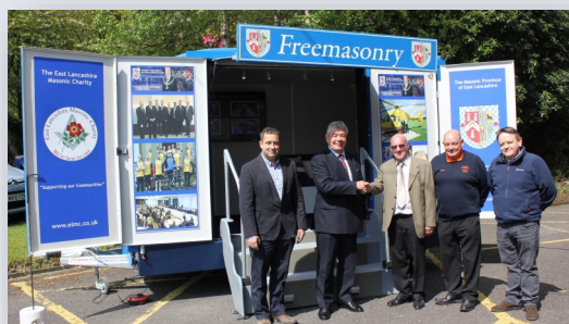
Provincial Trailer proudly liveried to promote both the Province and the ELMC