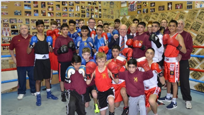
£1000 to Bury Amateur Boxing Club

2016 grants are listed on the ELMC website and include: