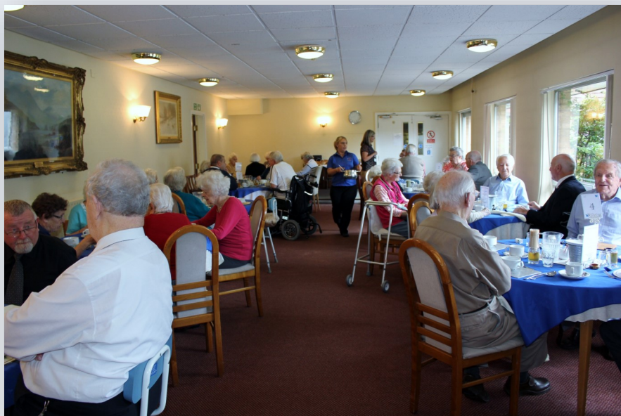
Lunch time at Hewlett Court, with the Advisory Committee