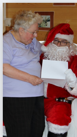
Christmas at Hewlett Court